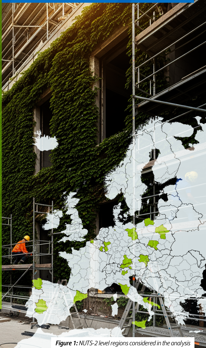
Figure 1: NUTS-2 level regions considered in the analysis